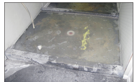
Figure 3. Concrete footbath built into the floor of the hallway.