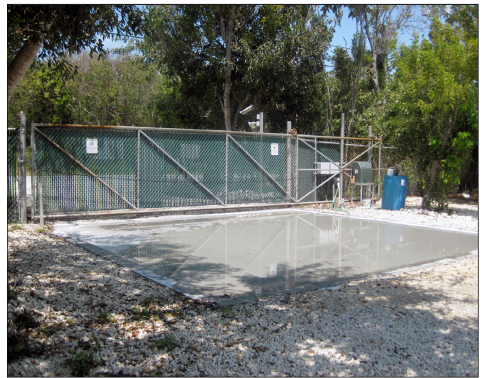
Figure 6. A drive-through disinfection area, consisting of a shallow area filled with disinfectant, to disinfect vehicle wheels.

Vehicle disinfection stations. Vehicles that travel from one facility to another may transport pathogens on their wheels. Having drive-through areas filled with disinfectant at entrances and exits can help reduce this risk (Fig. 6). If a facility is known or suspected to have an outbreak of an important disease, scrubbing stations, where vehicles can be scrubbed more thoroughly with brushes and disinfectant, may be necessary.